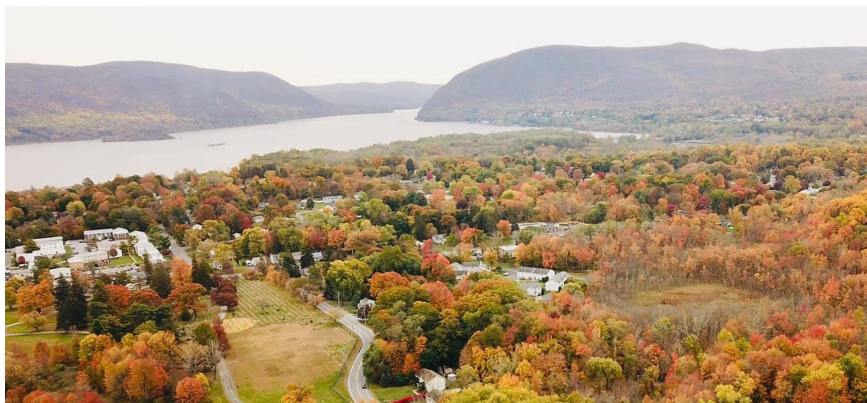
Autumn view of Erie Avenue looking towards the scenic Hudson River.

The New Windsor elected officials and employees are here to assist you in the best way possible. If you have questions, need information, or would like to express an opinion, please contact us. Your input helps us to serve you better.