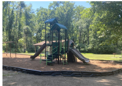
Ruscitti & Plum Point Parks, Renovated Summer of 2020