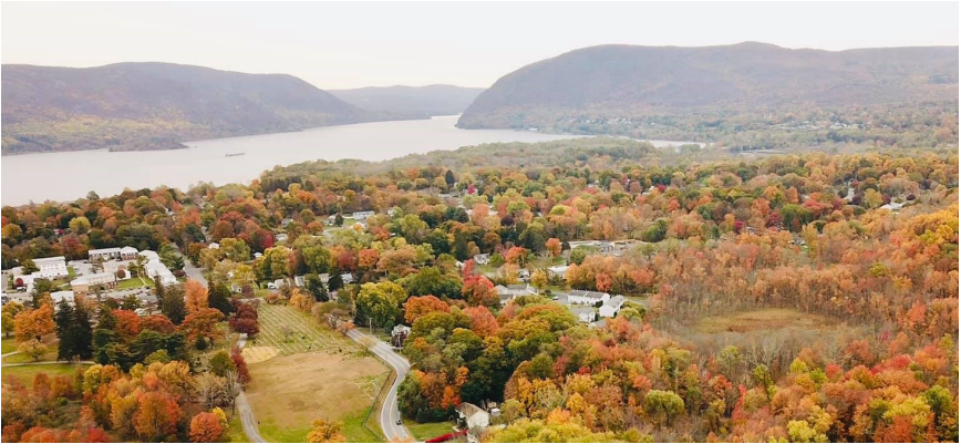
Autumn view of Erie Avenue looking towards the scenic Hudson River.

The New Windsor elected officials and employees are here to assist you in the best way possible. If you have questions, need information, or would like to express an opinion, please contact us. Your input helps us to serve you better.